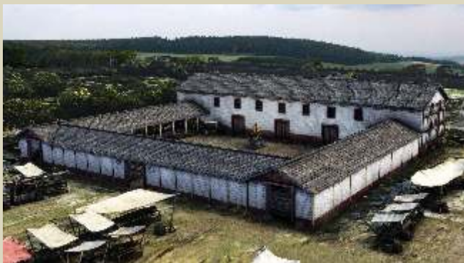
The Forum - Computer-Reconstruction: Faber Courtial

Adults 6,- € Children 3,- € Families 12,- € (max. two adults with children from 6 - 14 Years)